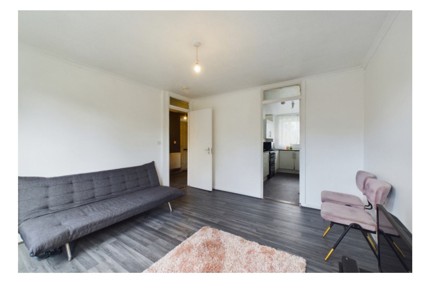
£415 Per Week